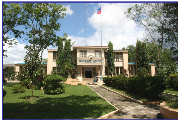
Municipal Hall of Nabunturan

History. NABUNTURAN was once a barangay of the municipality of Compostela. The name is a derivative from the word " BUNGTOD ". The natives called it such due to its elevated terrain compared to other areas within the valley. The early settlement was governed by a headman called "BAGANI" but was under the supervision of the Municipal District President of Compostela over matters only concerning civil affairs. For the maintenance of peace and order, the area was under the immediate supervision of the Philippine Constabulary Detachment of Camp Kalaw in Moncayo, now a municipality. From barangay Jaguimitan in the north to barangay Mawab, now a